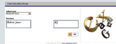
Font Selection Form screen

Borrower can select personal signing font